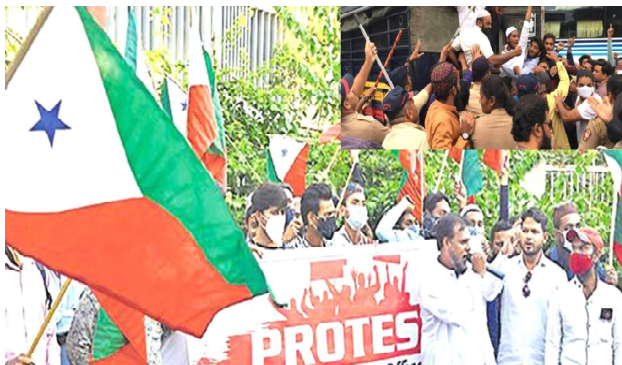
The PFI activists staging protest demonstrations. (Inset: The activists being rounded up by Police.

During Friday march, the activists reportedly raised the slogans such as "Pakistan Zindabad" and "Allahu akbar". However, the police did not confirm whether the slogan "Pakistan Zindabad" was raised saying that they have received some videos, which are being verified since there was too much din during the march. "We had ear-